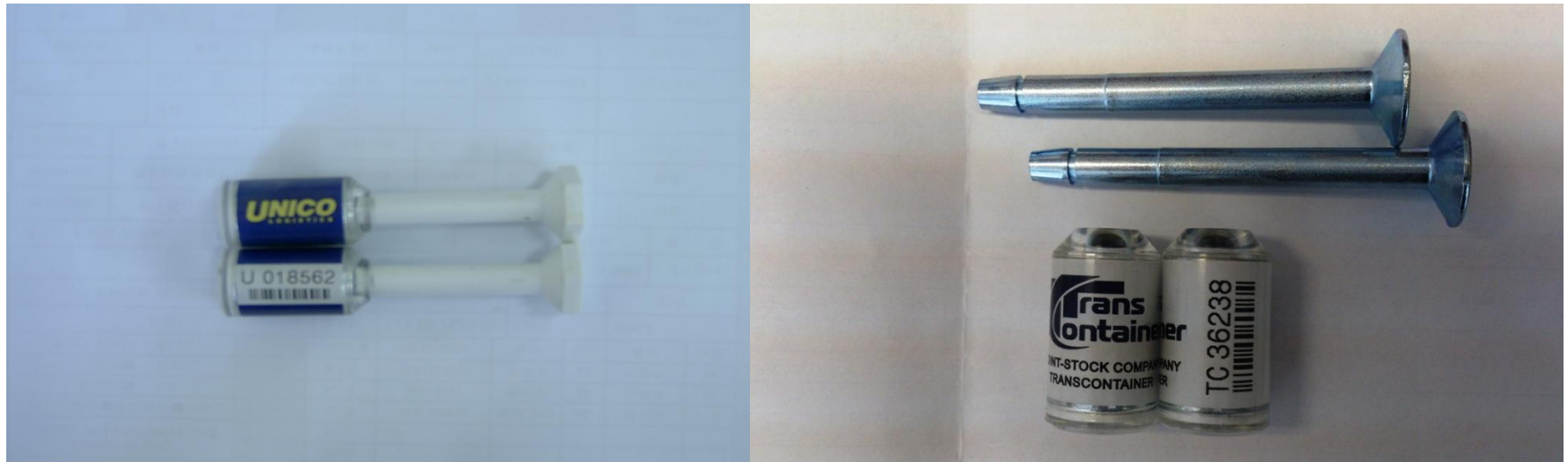
Sample of High Security (bolt) Seal

According to the Russia Customs regulation, following HIGH SECURITY SEAL must be used for the containerized shipment. Other type of seal are not allowed to use.